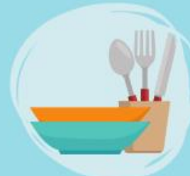
Wash utensils used by a sick person.