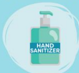
Use hand sanitizer if water and soap are not available.