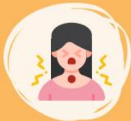
Very red, sore throat