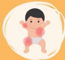
Bright red skin