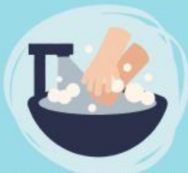
Wash your hands frequently.