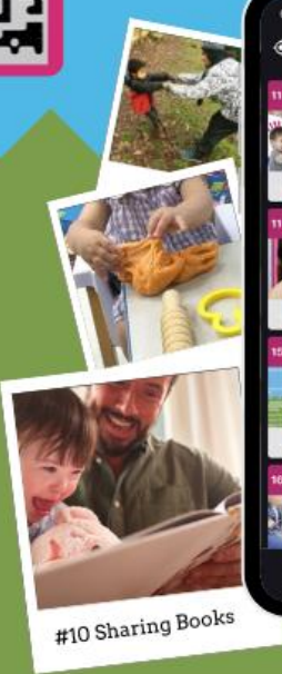
#10 Sharing Books

Use the free app and website at your own pace, enjoying the activities time and time again.